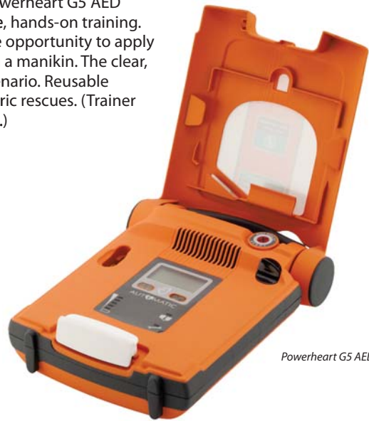
Powerheart G5 AED Trainer

The G5 AED Trainer is powered by three C batteries (training device) and two AAA batteries (wireless remote control).